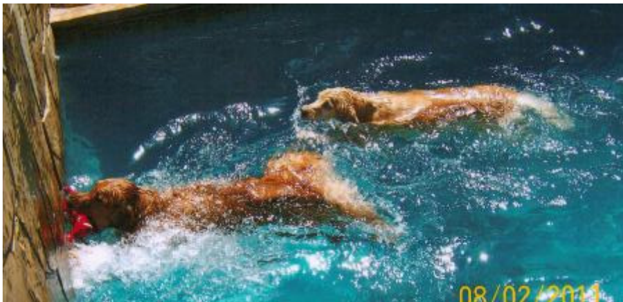
Tango and Sadie practicing for the relay races.