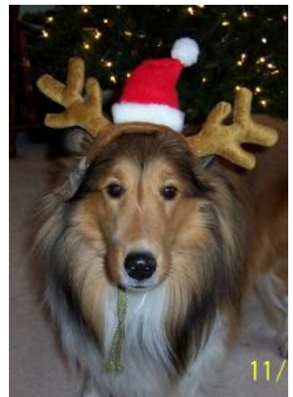
The little known 9th Reindeer— Trooper-deer