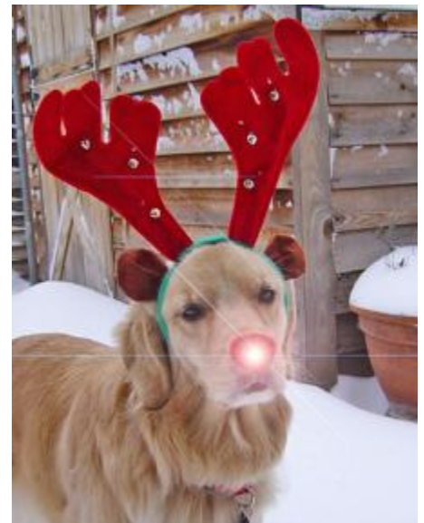
Sadie-deer— Rudolph's mentor