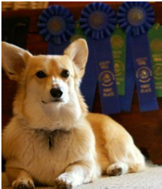
Emmy's Awesome Debut !